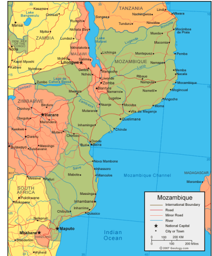
Figure1. Map of Mozambique

Mozambique covers an area of 799 380 km 2 , with 786 380 km 2 of land and the remaining 13 000 km 2 consisting of water bodies (Figure 1). The population of the country is about 20.2 million inhabitants with 81% in the subsistence agricultural sector. In 2008 the per capita GDP in the country was estimated at U.S. $956, a significant increase over the mid-1980s level of U.S. $120. The annual economic (GDP) growth rate was 6.5% in 2008. The industry sector contributes with 41.2% for the GDP, followed by services with 34.6% and agriculture with 24.2%. The Agenda 2025 (Mozambique’s long term vision) and the Five Year Plan are policy documents where development strategies and objectives in the country are defined. One of the main objectives is to reduce the levels of poverty and to promote a fast and sustainable economic growth. The country observes successive years of peace, stability, and economic growth, but remains dependent upon foreign assistance for much of its annual budget, and the majority of the population remains below the poverty line.